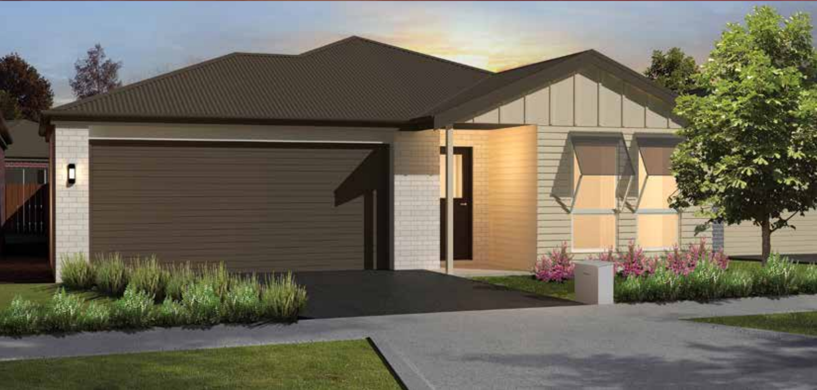
ARTIST IMPRESSION ONLY – SOME MINOR DETAILS MAY VARY AT CONSTRUCTION STAGE